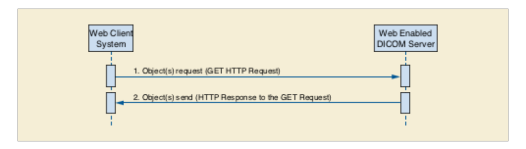
Figure 6-1. Interaction Diagram

The interaction shall be as shown in Figure 6-1.